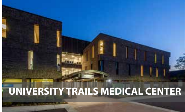
UNIVERSITY TRAILS MEDICAL CENTER