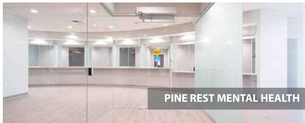
PINE REST MENTAL HEALTH