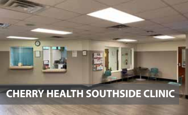
CHERRY HEALTH SOUTHSIDE CLINIC