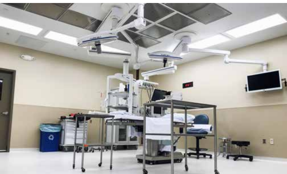
SPECTRUM HEALTH BUTTERWORTH