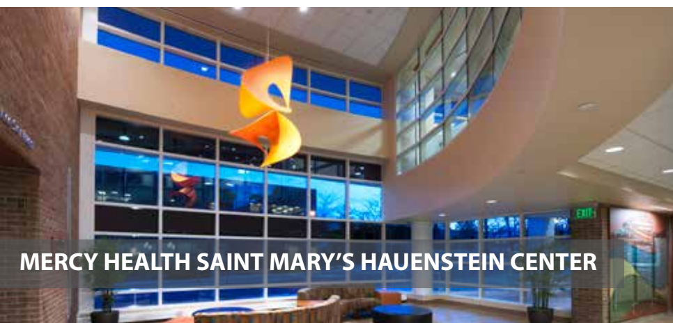
MERCY HEALTH SAINT MARY'S HAUENSTEIN CENTER