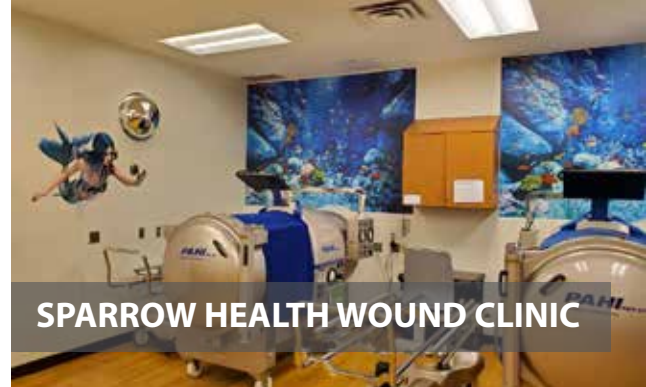
SPARROW HEALTH WOUND CLINIC