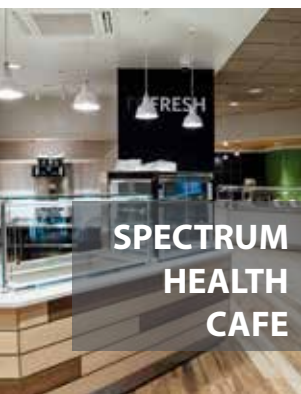
SPECTRUM HEALTH CAFE