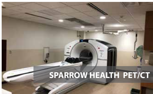
SPARROW HEALTH PET/CT