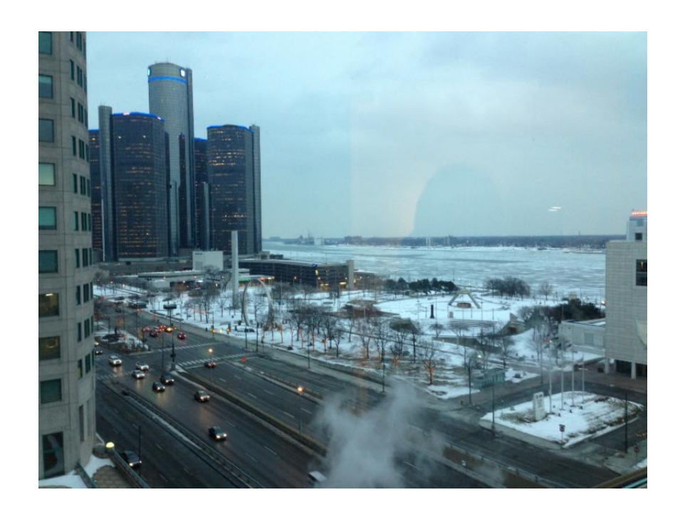
One of the views from the top of the Pontchartrain Hotel.